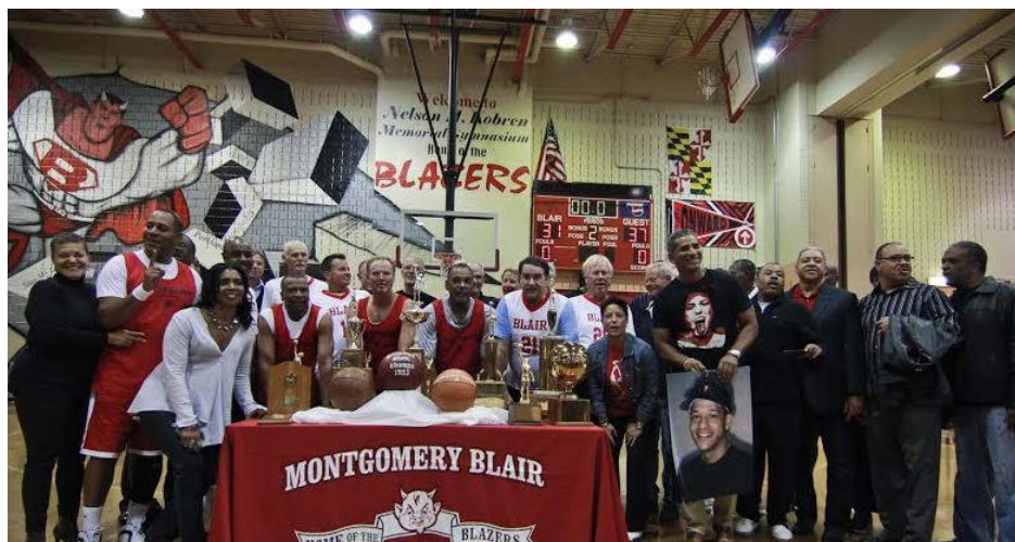
Players from all 10 of Blair State Championship Teams